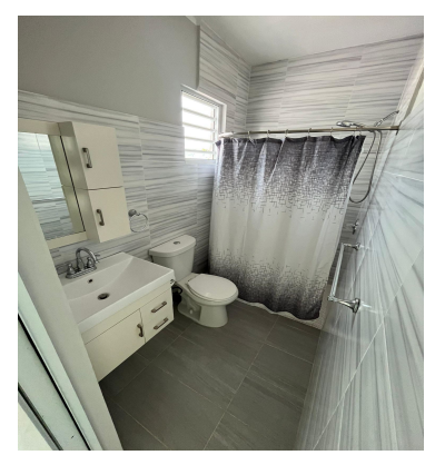
SEE THIS PROPERTY IN MAP