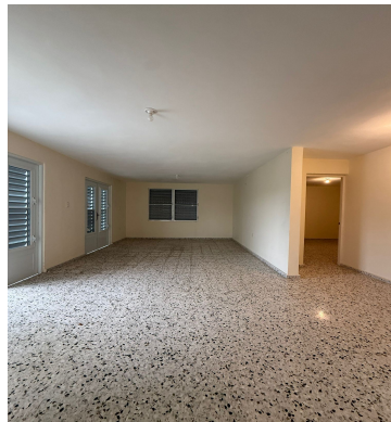
SEE THIS PROPERTY IN MAP