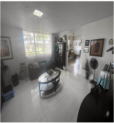
SEE THIS PROPERTY IN MAP