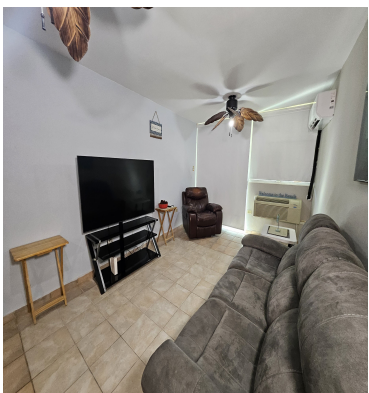
SEE THIS PROPERTY IN MAP