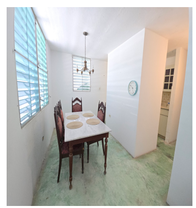
SEE THIS PROPERTY IN MAP