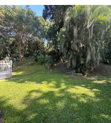
SEE THIS PROPERTY IN MAP