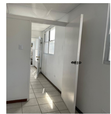
SEE THIS PROPERTY IN MAP