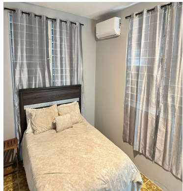
SEE THIS PROPERTY IN MAP