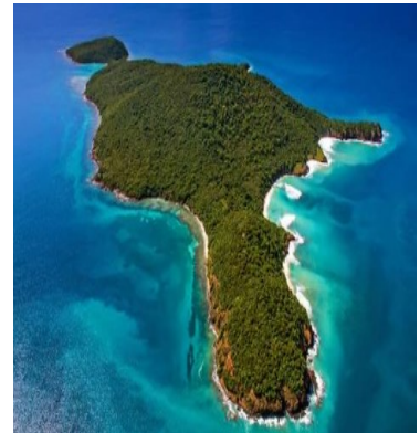
SEE THIS PROPERTY IN MAP

THIS PROPERTY IS PROMOTED BY RE/MAX CLASSIC