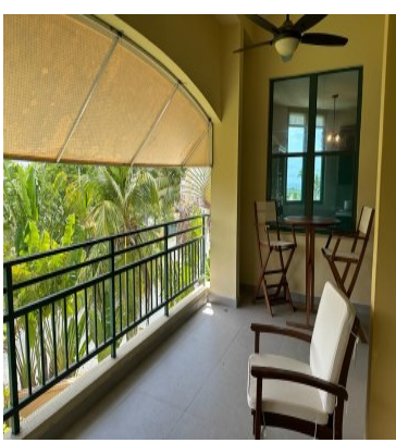
SEE THIS PROPERTY IN MAP